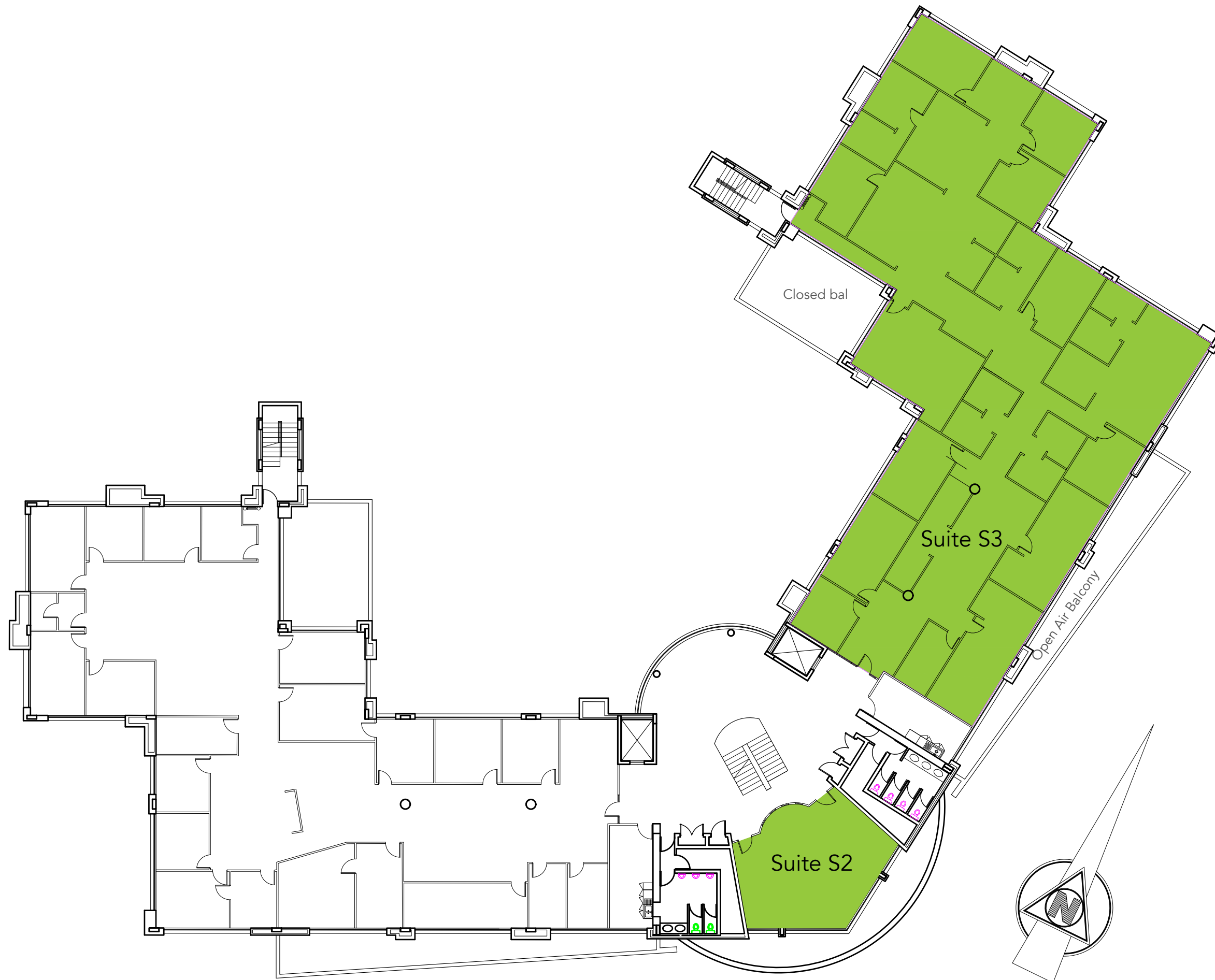
11 NAIVASHA ROAD SECOND FLOOR PLAN