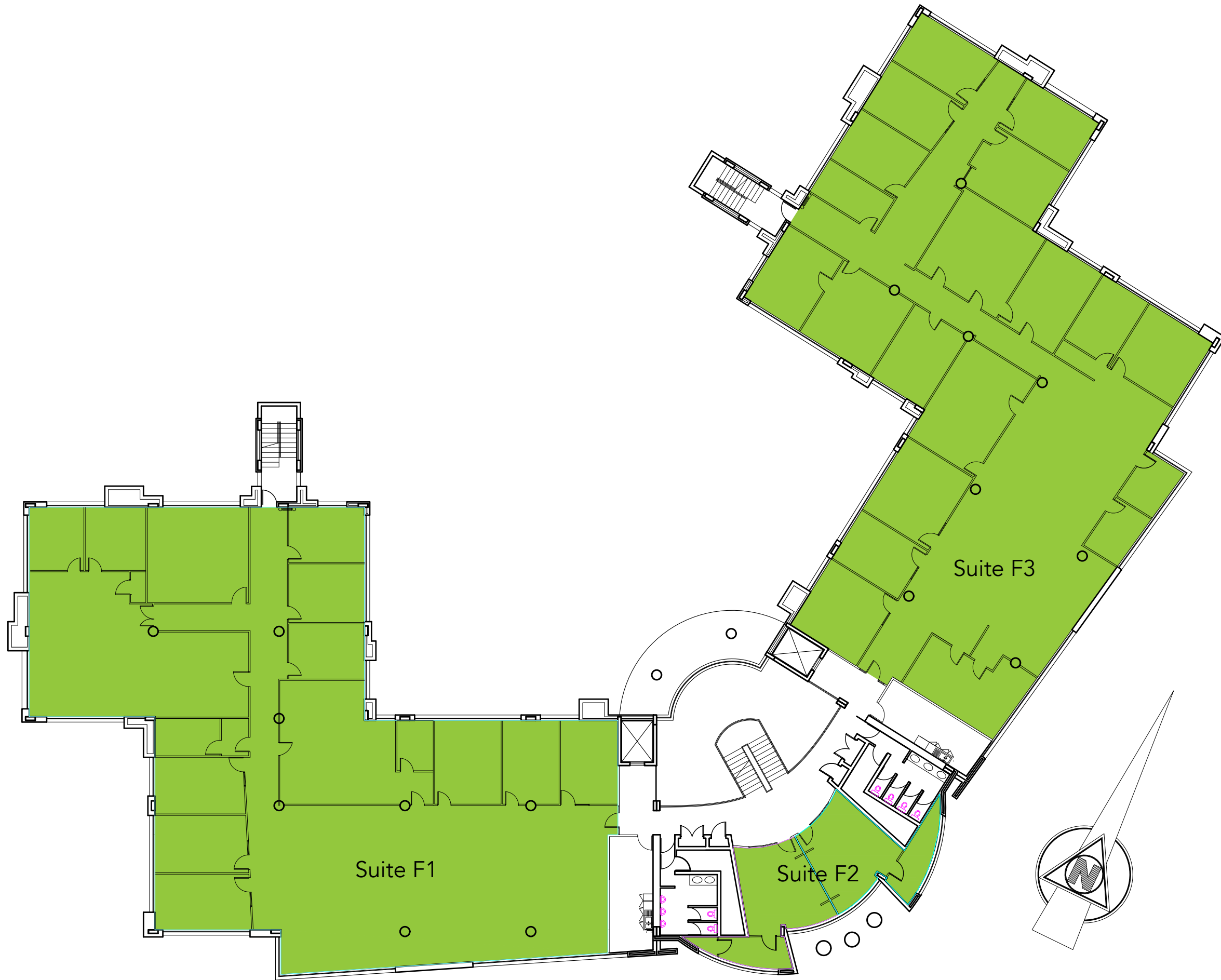
11 NAIVASHA ROAD FIRST FLOOR PLAN